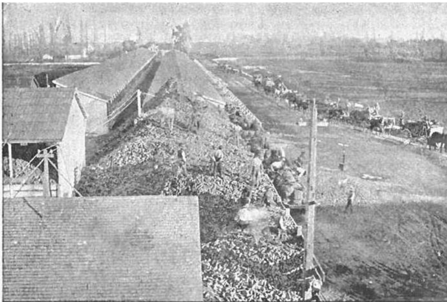
Receiving Beets at Alvarado

The Alvarado sugar mill had an average season in 1881, and a fair supply of beets at a moderate price made for a profitable year. But a problem with the longevity of the harvested beets kept the Alvarado mill from enjoying an even better year. The quality of the beets was good, and the only drawback appeared to be in the difficulty of keeping the beets for a sufficiently long winter campaign. If the beets are placed in silos, as is the general custom in Europe, they will heat and sprout in a short time, and if it is placed within easy reach of the factory, they are apt to suffer from frost at night and warm sunshine during the following day. This prevents the season to be carried into the spring, as it would be most desirable to ensure financial success. But at the end of the 1881 campaign, California laid claim to the distinction of having a beet sugar mill that had a sugar mill running for three years in succession (1879 - 1881). Three consecutive years is a long life for a beet sugar enterprise in the United States.