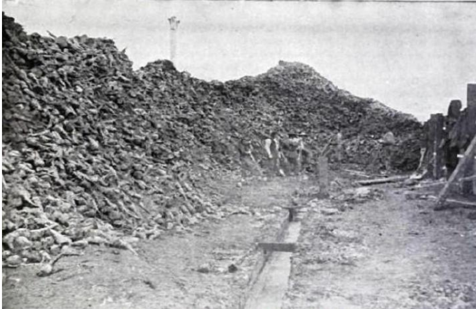
A sluiceway to carry beets to the factory in Alvarado, Calif.

At the beginning of 1880 there were but three beet sugar factories in the U.S. One was at Isleton in Sacramento County, which was idle. Another was at Soquel, in Santa Cruz County, but 1880 would be its last year of operation. The third factory was at Alvarado, and its future was not any brighter than the other two (this according to the Decatur Daily Review in Illinois).