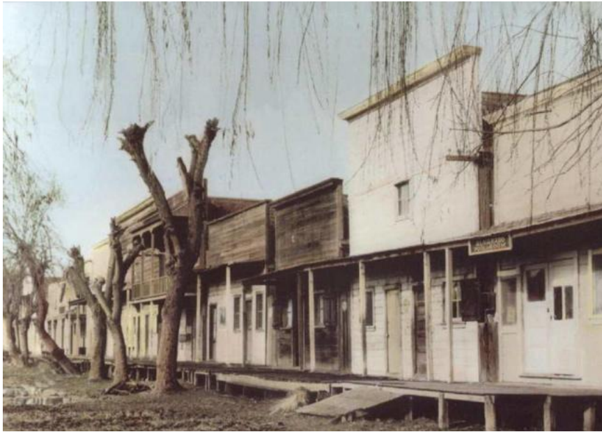
Alvarado's Chinatown circa 1920. Note that Smith Street is not yet paved. Also note the boardwalk used to protect foot traffic during the rainy season and when the seeming annual floods would arrive. Also note that all of the buildings are raised to the level of the boardwalk to protect occupants during the floods. These boardwalks were common throughout Alvarado, taking the place of the more traditional sidewalks in locales where flooding was not prevalent.

Though initially authorized to last ten years, the Exclusion Act was extended and strengthened over the next eighty. In 1892, Congress extended the act for another decade, and in 1902, lawmakers made the act permanent, and added more discriminatory provisions. The legal ban on immigration from China was slightly loosened in 1943, but large-scale Chinese immigration was not restored until passage of the Immigration Act of 1965."