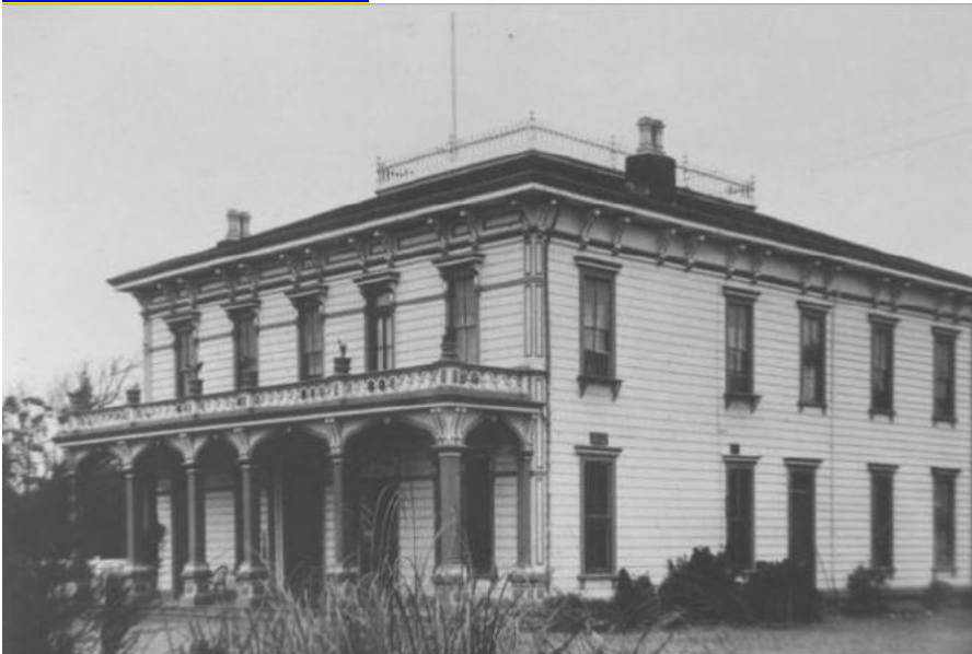
The Riverside Hotel after turn of the century