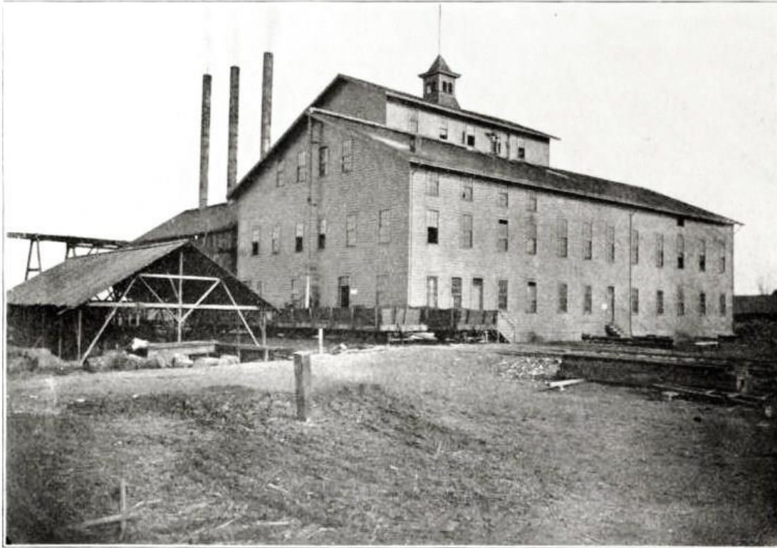
ALVARADO, PACIFIC COAST SUGAR CO.

Water Company brought a lawsuit against the Pacific Coast Sugar Company to acquire and hold, the right to take, appropriate, and divert the waters of the Alameda Creek for the company's use for its San Francisco patrons. The sugar mill was owner of seventy-three acres, and this land had a frontage of 980 feet on Alameda Creek.