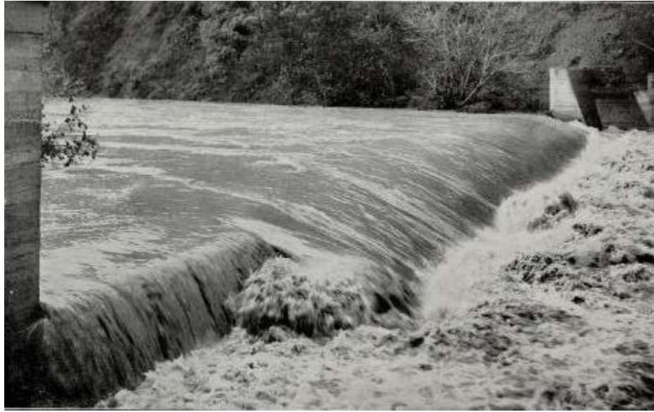
The dam to impede the flow of water down Niles Canyon about one mile south of the Sunol Water Temple.

By 1888, the Spring Valley Water Company had settled itself like an old man of the mountain upon Alameda County, it had twisted its sinewy legs about the neck of Washington Township, and openly declared that what they may not be able to accomplish with coin and fair words, they would accomplish by legal force if necessary, in the condemnation of a right of way for pipes that will carry off the water of Alameda Creek, leaving the rich soil of the township as dry and unproductive as a desert. The people of Niles, Centerville, Irvington, and Alvarado were thoroughly alarmed at the prospect, and were murmuring against the great wrong which was contemplated.