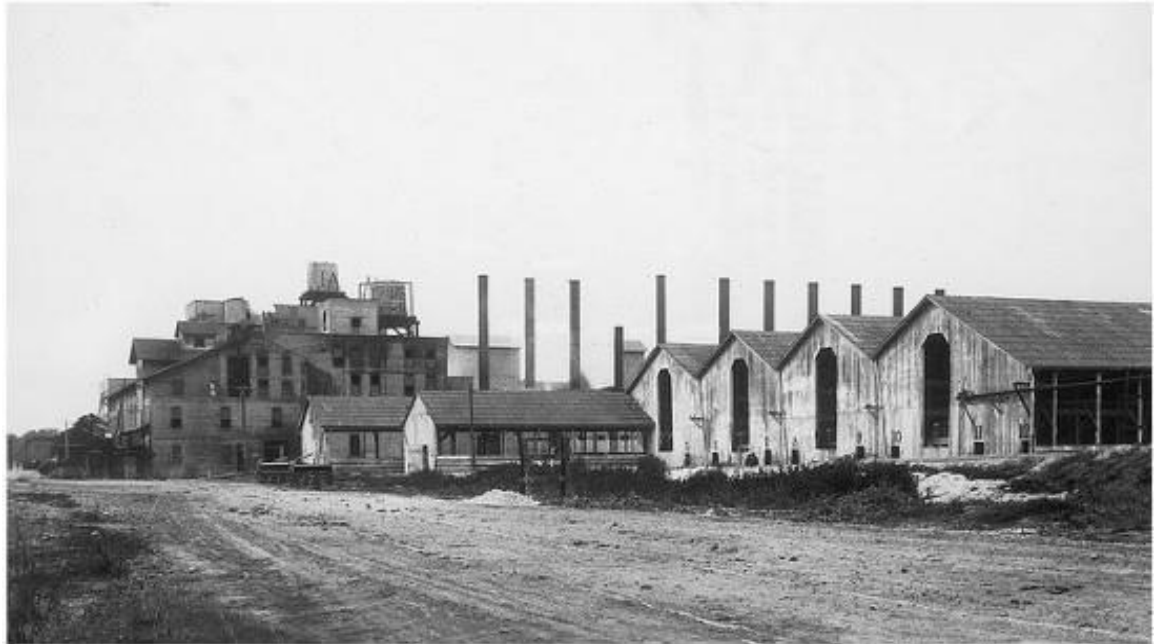
THE SUGAR MILL AT ALVARADO

The 1910 campaign had been a record breaking one, the output being in the neighborhood of 400,000 sacks of sugar. The campaign ended at the end of November. At this same time a rumor was spreading that the Alameda Sugar Co. would erect a plant at Woodland, where they had 14,000 acres of sugar beets under cultivation; as the cost of transportation of the raw material between Woodland and Alvarado was so large that the company intended to put the beets through the raw stages of sugar making in the Sacramento area, and then shipping the product to Alvarado for refining.