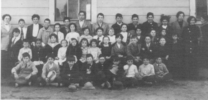
Alviso School - Circa - 1909