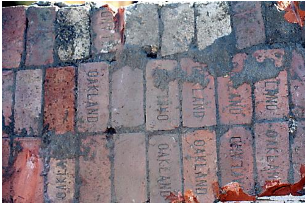
Bricks produced at the Oakland Paving Brick Co. between 1911 and 1912.

Finished bricks were shipped to market by rail, the plant being conveniently situated between the lines of the Southern Pacific and Western Pacific railroads. The site had a dedicated rail spur which was given the acronym "PABRICO," which was an abbreviation of "paving brick company." If you look at a map of the Fremont-Union City boundary at the Alvarado-Niles Road where it intersects with the railroad tracks you will still see that area is still titled "PACRICO."