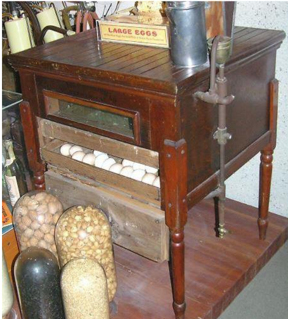
Wooden incubator for eggs, heated by wood and kerosene. Glass door in the front permits viewing of the eggs. Marked "Victor Incubator Co., Decoto Calif."